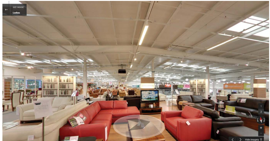
Business View in the Leekes Coventry store.